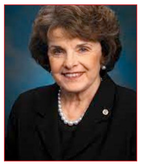
Senator Diane Feinstein (D-Calif.)

"I applaud the Port of Oakland and the FAA for their collaborative efforts to maintain and upgrade Oakland Airport, one of California's critical transportation hubs," said Senator Di-