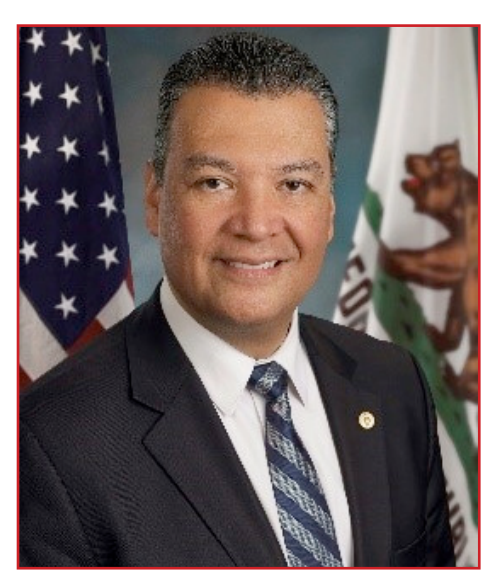
Senator Alex Padilla (D-Calif.)

"I was proud to have voted to pass the Bipartisan Infrastructure Law, which continues to provide critical investments across the state to support essential transportation infrastructure like airfield and facility improvements at Oakland In-